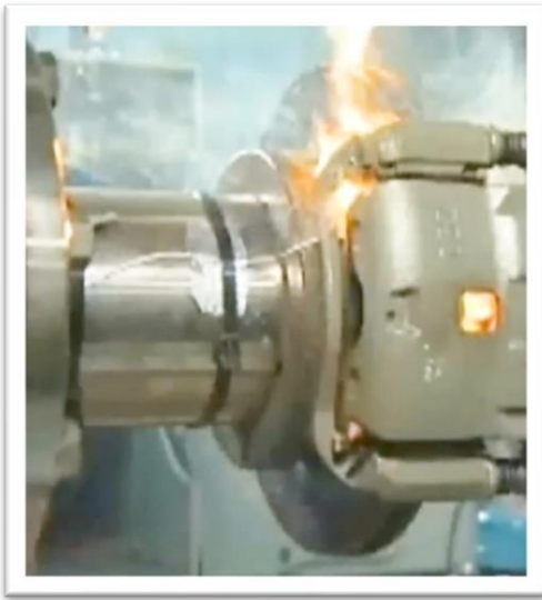
COUNTERFEIT BRAKE PAD

An Analysis of How Online Marketplace Practices Allow Counterfeiters to Put Unsafe Products in American Consumers' Cars, and Proposed Solutions for Minimizing the Proliferation of Counterfeits